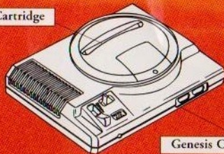
Genesis Control Pad 1