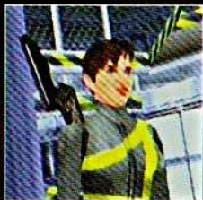
Joanna Dark (Human Female)