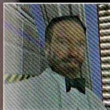
Daniel Carrington (Human Male)

Profile: The Institute's most experienced undercover agent. Highly accurate with chosen weapon (Magnum Revolver). Perfectly suited to undercover missions. Less suited to out-and-out combat. Before Joanna Dark, he held the honor of having the highest recorded training scores.